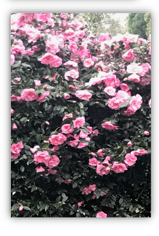
And don't forget to admire the camelia hedge just down the road!