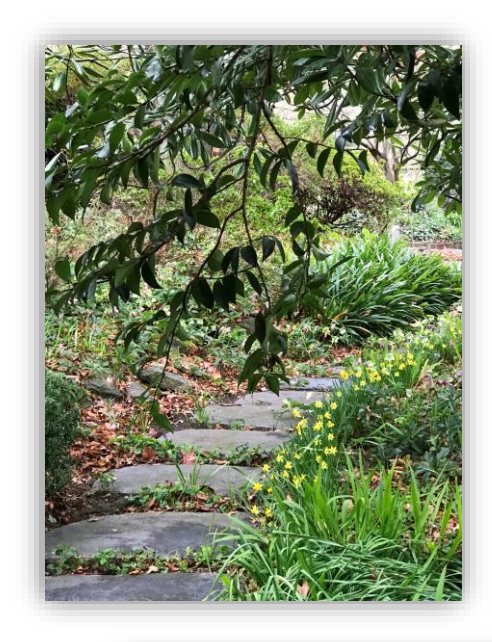
Then up the stepping stones, lined with miniature daffodils, past the weeping camellia bushes towards the back where we are greeted by masses of colourful hellebores.