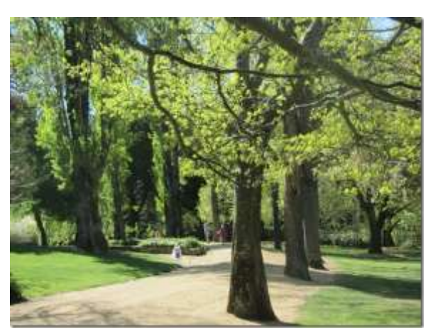
Shirley, Nimmitabel. Magnificent driveway entrance.