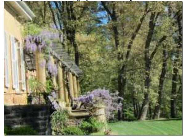
Hazeldean, Cooma. Wisteria in flower with elm tree forest behind.