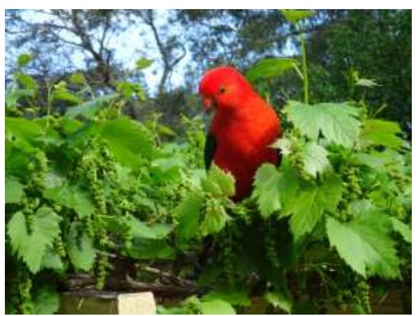
Yum Yum, I think I might just help myself to some of these. One of the many visitors to our garden. Pat Keen