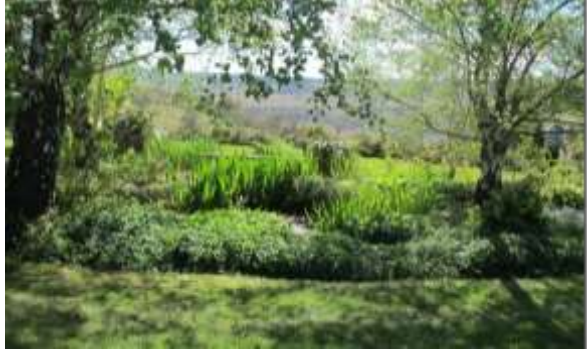
Erindale, Nimmitabel. View through silver birch and pond to countryside.