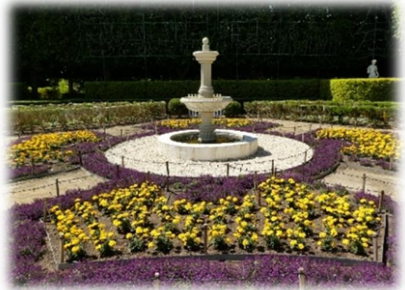
The Formal Garden

'A love of gardens enhances lives and brings with it an appreciation of nature's beauty. Gardens also provide a counter to the many pressures of day to day living. The spiritual experience of getting back to nature and into gardens is very rewarding' Bill Roche, the garden creator.