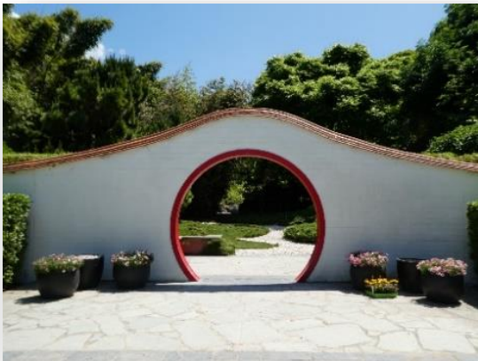
Entry to the Chinese Garden

The plan was to create 10 themed gardens and over 8km of pathways.