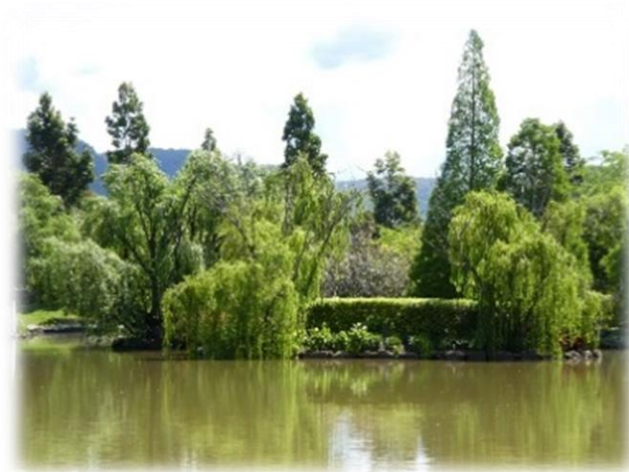
The Oriental Garden