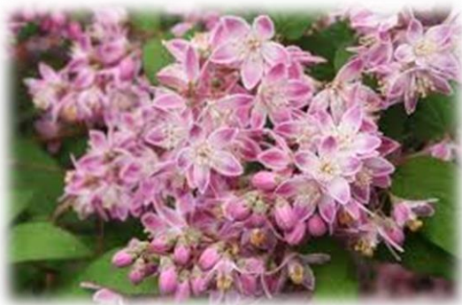
Deutzia x hybrida 'Magicien'

I have this stunner in my garden and is a joy when it flowers late Spring.