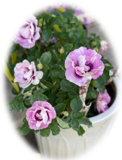
Eyes for You - Rose