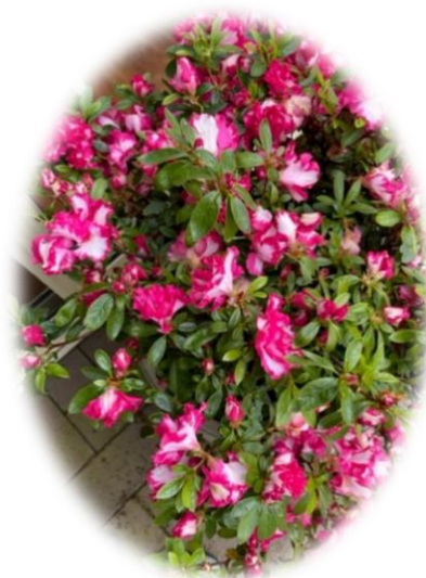
Azalea – 'Gretel'